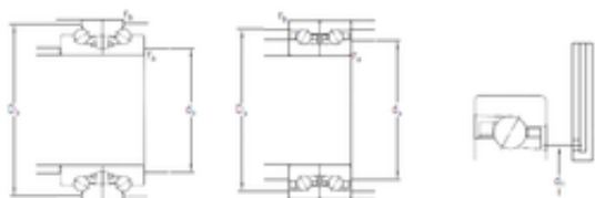
BTM 75 ATN9/HCP4CDB Bearing 2D drawings and 3D CAD models